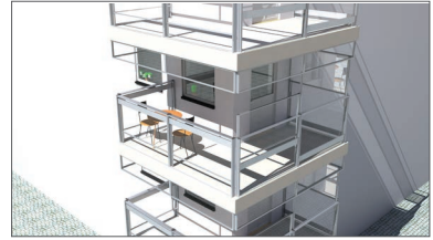
Cit i Lä® without extended side posts and with fixed overhead glass attached upwards.