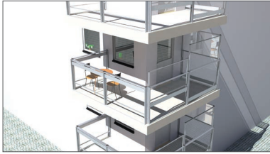
Cit i Lä® höj- height adjustable glass railing.