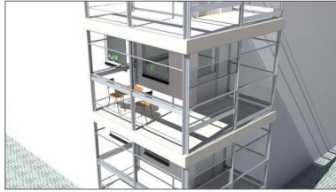
Cit i Lä® with extended side posts and fixed overhead glass.